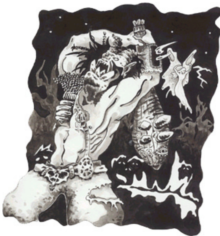
Illustration © Inge Vermeylen

These particular events vary from clan to clan. They often feature strategy