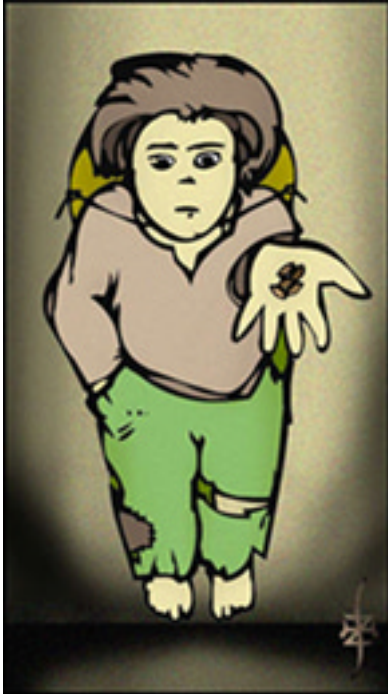
Illustration © Ezaustszel

While staying in Urupa, I had the pleasure of indulging in an informal meeting with the small enclave of Cathayans that have taken up residence in the Visitor's Quarter. Before I lost one half of my purse, I overheard one of the women tell a group of children a favorite tale of theirs, called 'The Little Judge.'